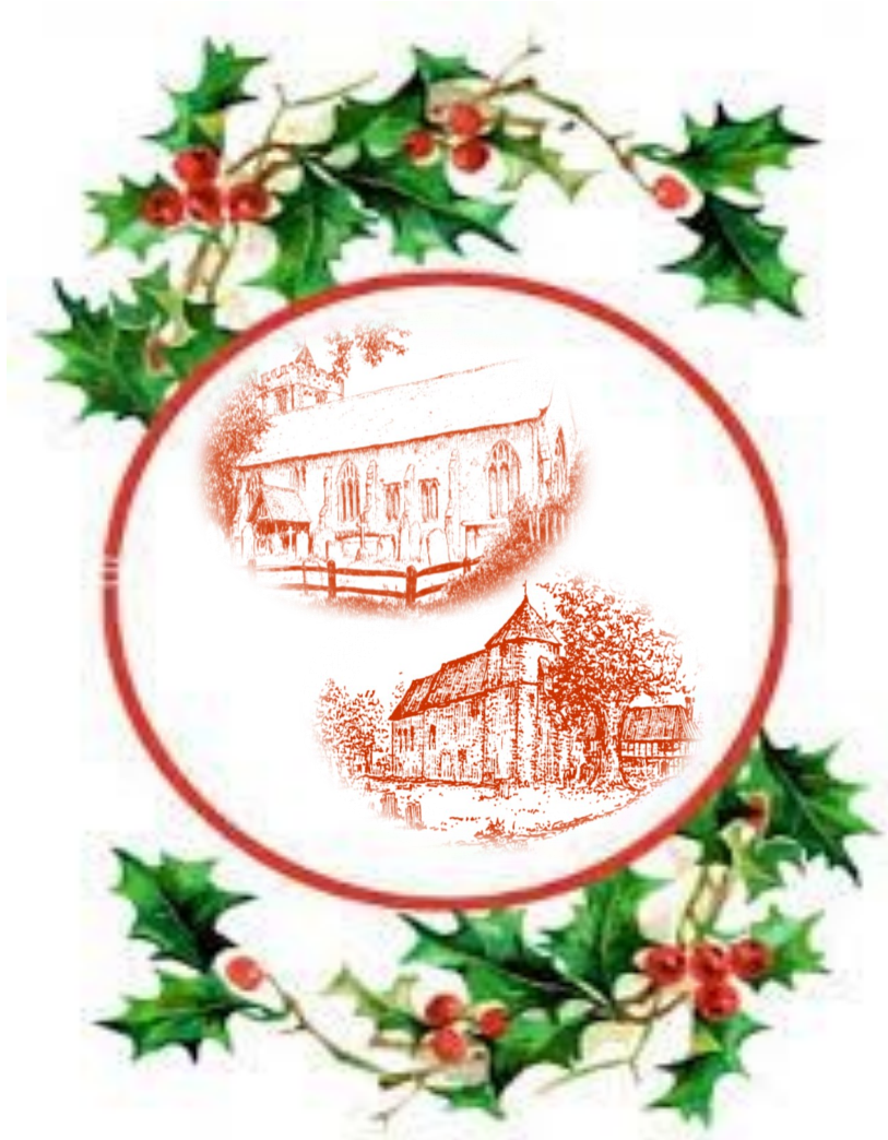
ST. GEORGE'S, BREDE & ST. MARY'S UDIMORE