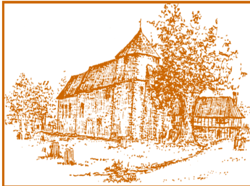
ST. MARY'S, UDIMORE