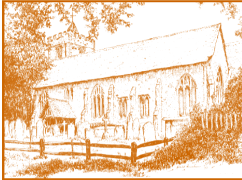
ST. GEORGE'S, BREDE