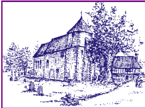
ST. MARY'S, UDIMORE