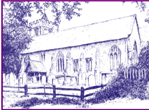
ST. GEORGE'S, BREDE